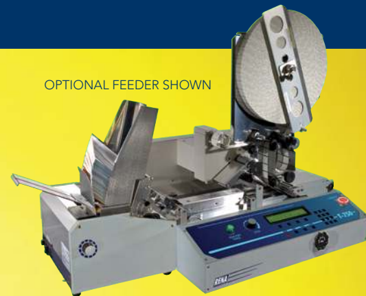
OPTIONAL FEEDER SHOWN