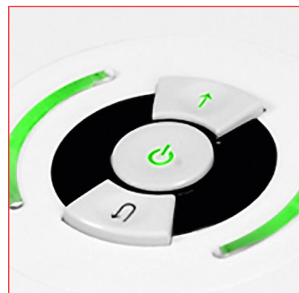
Dynamic Load Sensor shows users if they are feeding items at the appropriate rate or if they should feed faster or slower