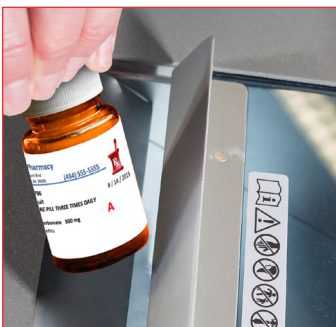
Top feed slot accepts pill bottles and other bulky items - clear cover allows viewing of the destruction process