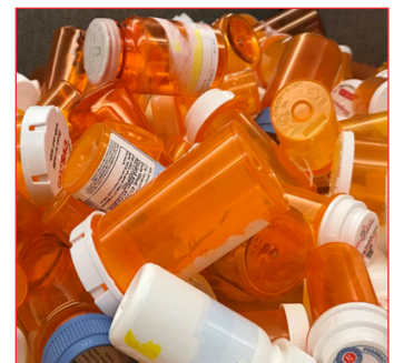
Destroy a wide range pill bottle sizes up to 16 oz. including lids. Accepts wet or dry bottles