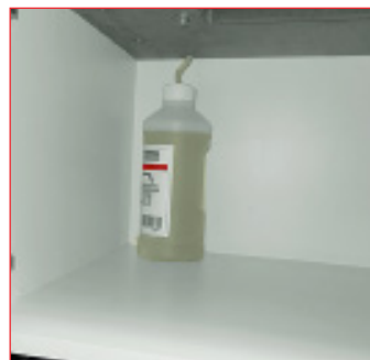
Automatic oiler keeps cutting head lubricated for peak performance - easy change bottle eliminates the hassle of filling a reservoir