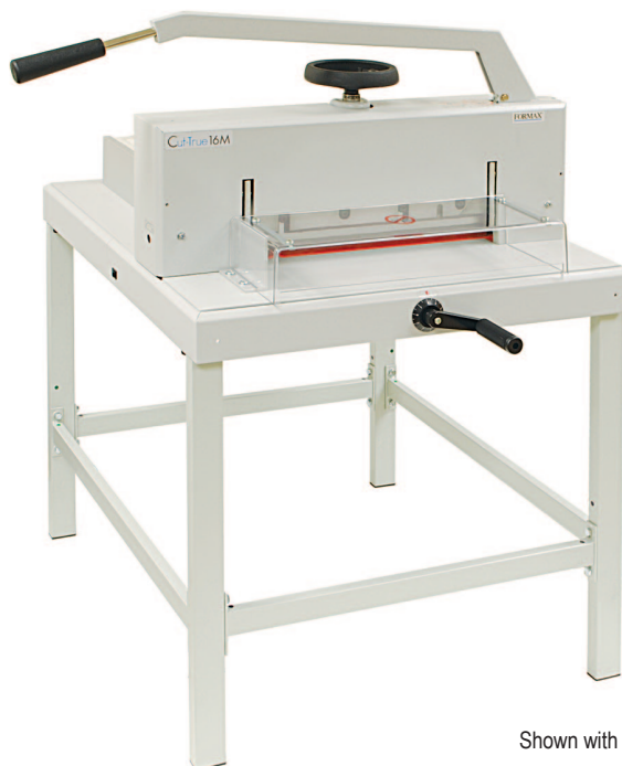
Shown with stand, included

The Formax Cut-True 16M Manual Paper Cutter combines accuracy with ease-of-use in cutting paper up to 18.7" wide. With its hardened-steel Guillotine blade, and lever-activated blade arm, it has the capacity to cut through paper stacks up to 3.15" with razor-sharp precision.