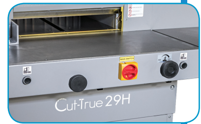
Two-button operation, fine-tune knob, adjustable hydraulic pressure