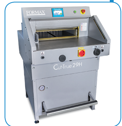
Standard model, without side tables