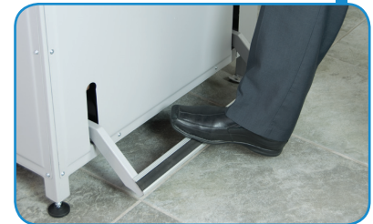
Foot pedal pre-clamp holds paper to check alignment prior to cutting