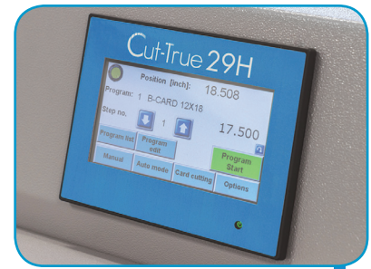
Touchscreen control panel allows for programming up to 100 jobs

* 31"W with safety curtains removed for easier transport through doorways. 33.5"W including safety curtains.