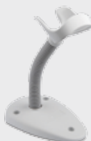
▪ STD-QD24-WH Stand, White