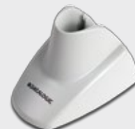
▪ STD-AUTO-QD24-WH Stand, White