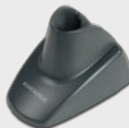
▪ STD-AUTO-QD24-BK Stand, Black