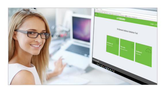
Over 40 million people and roughly one-in-five businesses move each year. This is where ConnectSuite e-Validate can help.

ConnectSuite e-Validate is a remarkably simple cloud-based address correction service that helps you quickly and easily validate customer addresses in a few simple clicks...no downloads or training required.