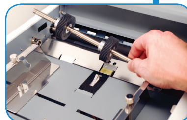
Removable Feed Wheels