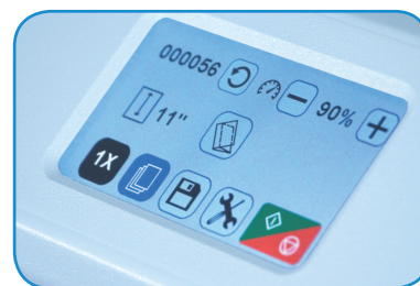
Large color touchscreen