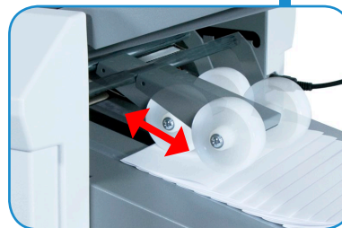
AutoStack™ Stacker Wheels