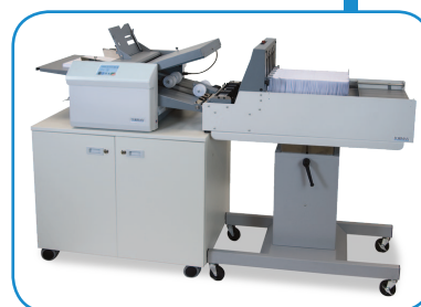
FD 38Xi in-line with optional V-Stack36i Vertical Stacker, stand and cabinet

Formax - New Hampshire, USA www.formax.com