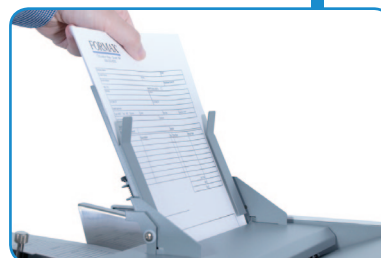
Dedicated Multi-Sheet Feeder