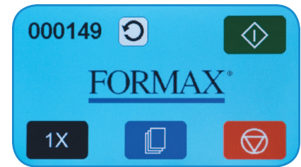
Touchscreen Control Panel

The FD 346 Document Folder is a fast, dependable and easy-to-use solution for virtually all folding applications. The color touchscreen control panel uses internationally-recognized symbols in place of text, making it easy for anyone to use. Six popular folds are clearly marked on the fold plates: simply slide the fold stop to the desired fold. Additional adjustments can be made with the fine tuning knobs at the end of each fold plate for precision folding.