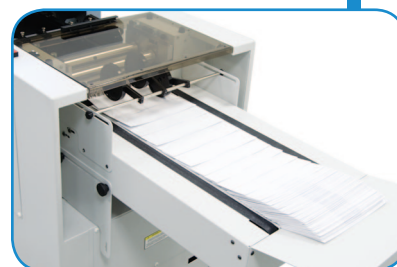
24" outfeed conveyor helps keep forms in a neat order after processing