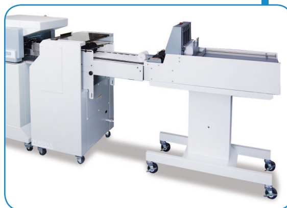
FD 2096 Pressure Sealer, in-line with optional V-Stack36 Vertical Stacker and V-Stack36-10 Adjustable Stand

Formax - New Hampshire, USA www.formax.com