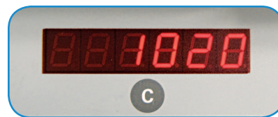
6-digit resettable LED counter