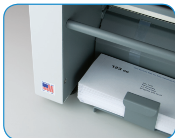
Proudly made in USA