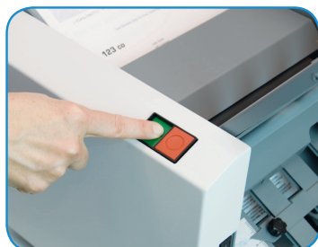
Ergonomic ON/OFF switches