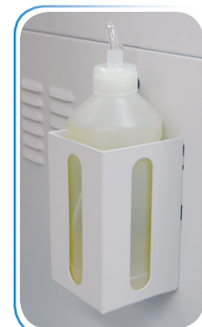
AutoOiler - Automatically pumps oil onto the cutting blades

Visit www.formax.com to watch the product demonstration video