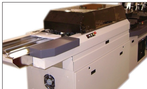
Continuous loading input